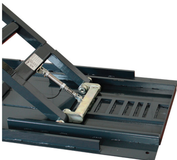
Mechanical and hydraulic safety devices

MAXIMUM CAPACITY FROM THE FULLY LOWERED POSITION In accordance with the EN 1493 VEHICLE LIFTS European standard Lowering stop device and acoustic signal